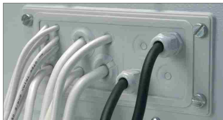
Frame Cat. No. & Dimensions