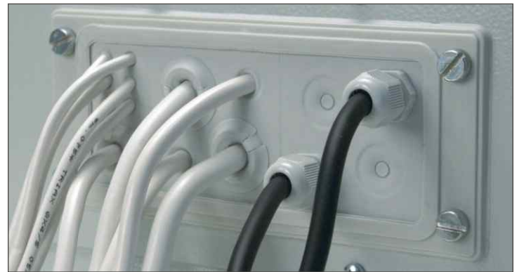
Frame Cat. No. & Dimensions